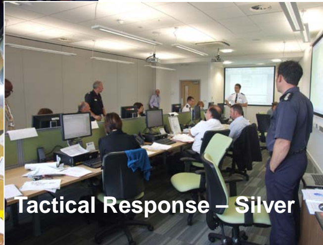
Tactical Response – Silver